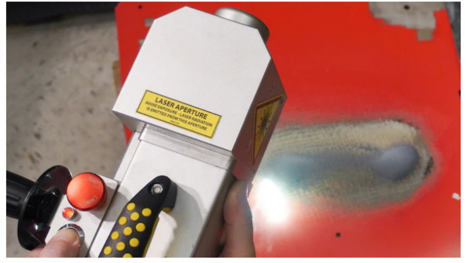
The technology minimizes operator exposure to potential environmental health hazards and no consumables are necessary.

Industries have been fighting a war against corrosion in metal infrastructure, equipment and products at great expense for generations.