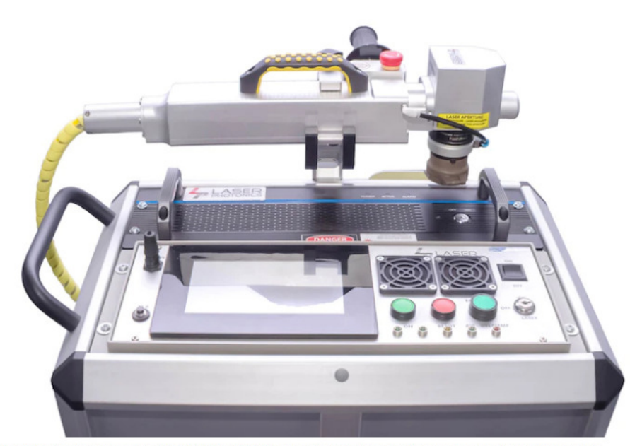
CleanTech laser systems can last for 50,000 to 100,000 hours with virtually no maintenance needed after purchase and no consumables required.