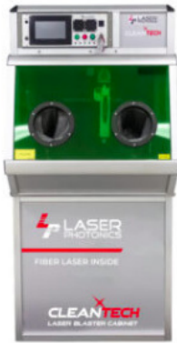
The approach is eco-friendly, energy-efficient, and completes the job in half the time of traditional methods when preparation and cleanup are considered.

"CleanTech laser systems can last for 50,000 to 100,000 hours. That's many decades working eight-hour days. After purchase, there's virtually no maintenance necessary," concludes Galiardi.