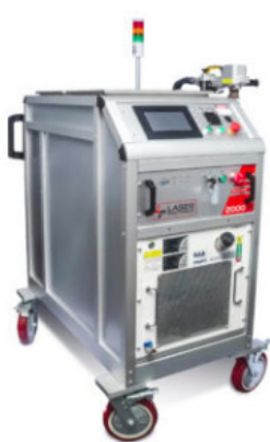
Laser systems remove residue, corrosion, and existing coatings from metal weld surfaces quickly, with less preparation and mess than traditional techniques.

To treat weld surfaces, sandblasting, chemical stripping, or grinding are traditionally used as industrial cleaning processes. However, these options have limitations.