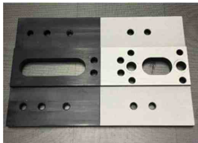
New part (left) laser cleaned and prepared for paint or welding.