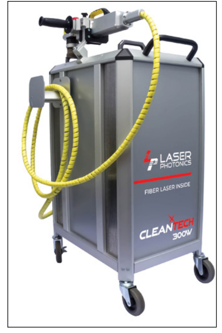
Laser systems remove corrosion with less preparation and mess than traditional techniques.

ing, and dispose of the waste. In addition, disposing of toxic chemicals is costly and closely regulated by agencies like OSHA and the EPA.