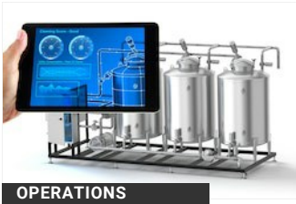
OPERATIONS Emerson's New Analytics Software Automates Utilitie... Place Applications