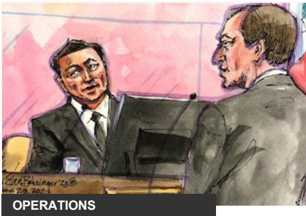
OPERATIONS Elon Musk: Tweets About Taking Tesla