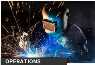
OPERATIONS Hobart Opens New Customer Experience Cent... Support and Training