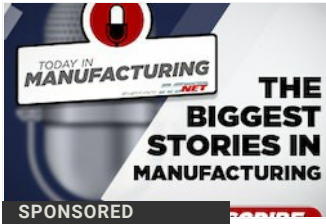
SPONSORED Today in Manufacturing Podcast