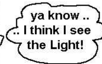
Albert Einstein ... Theorized the concepts of Light Physics in 1917

Due to all the options available to end users, selecting the right laser for an application can be an arduous process and deciding to upgrade from a CO2 to a fiber laser system may bring even further challenges. Laser Photonics can help answer those tough questions and has provided our customers with a new tool to compare systems. Using the Cost Comparison Calculator found on the home page of www.LaserPhotonics.com , customers can key in their location, the power of their CO2 laser and their typical daily use. The calculator will then reveal pertinent information such as: the tremendous cost savings, increased reliability, and enhanced beam quality and spot size of Laser Photonics Fiber Laser Systems. Users will quickly see what was once the top of the line CO2 laser system, and the best solution several years ago, now greatly pales in comparison to a new Laser Photonics Fiber Laser System.